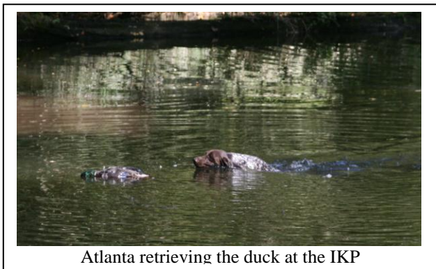
Atlanta retrieving the duck at the IKP